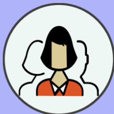
£600m benefits to patients