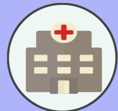
£242m avoided NHS treatment costs