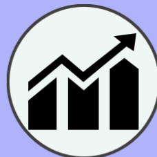
£1bn benefits to the public sector and wider economy