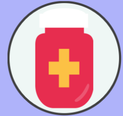
Support for self-care