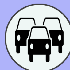
Reduced travel time