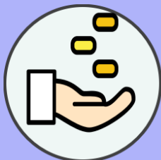
£1.1bn NHS cash savings