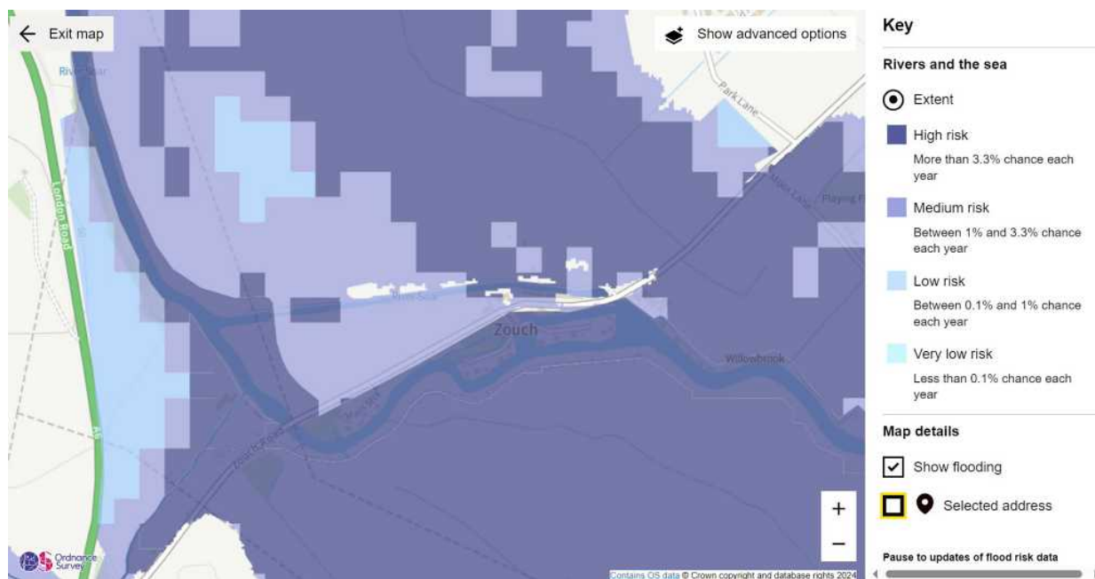
Figure 3. Environment Agency – Flood Risk Mapping for Zouch