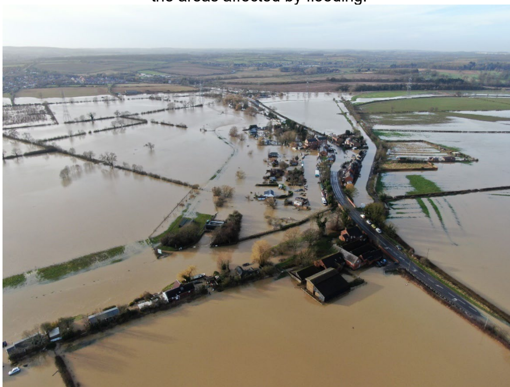
Figure 4. Aerial footage for flood affected areas across Zouch.