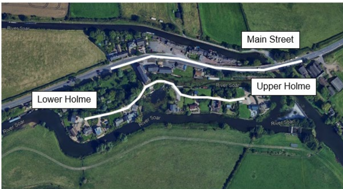
Figure 2. Reference map for flood affected areas across Zouch. Main Street (9), Lower Holme (11), Upper Holme (4).