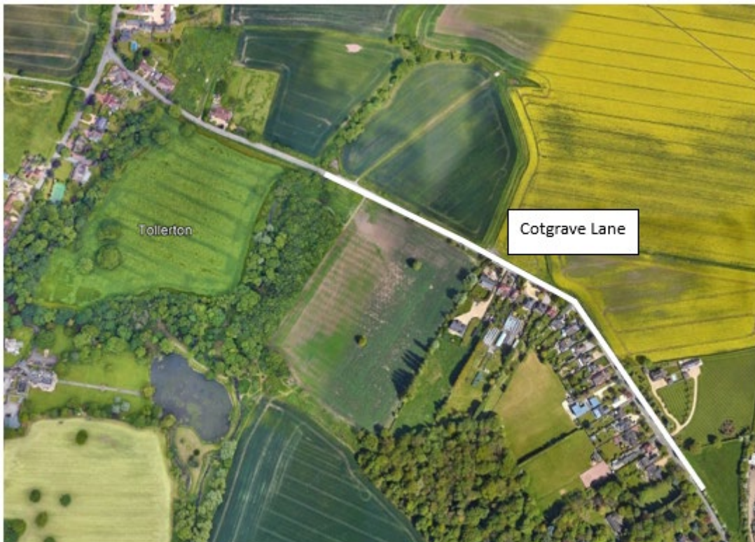
Figure 2. Reference map for flood affected area in Tollerton. Cotgrave Road (5).