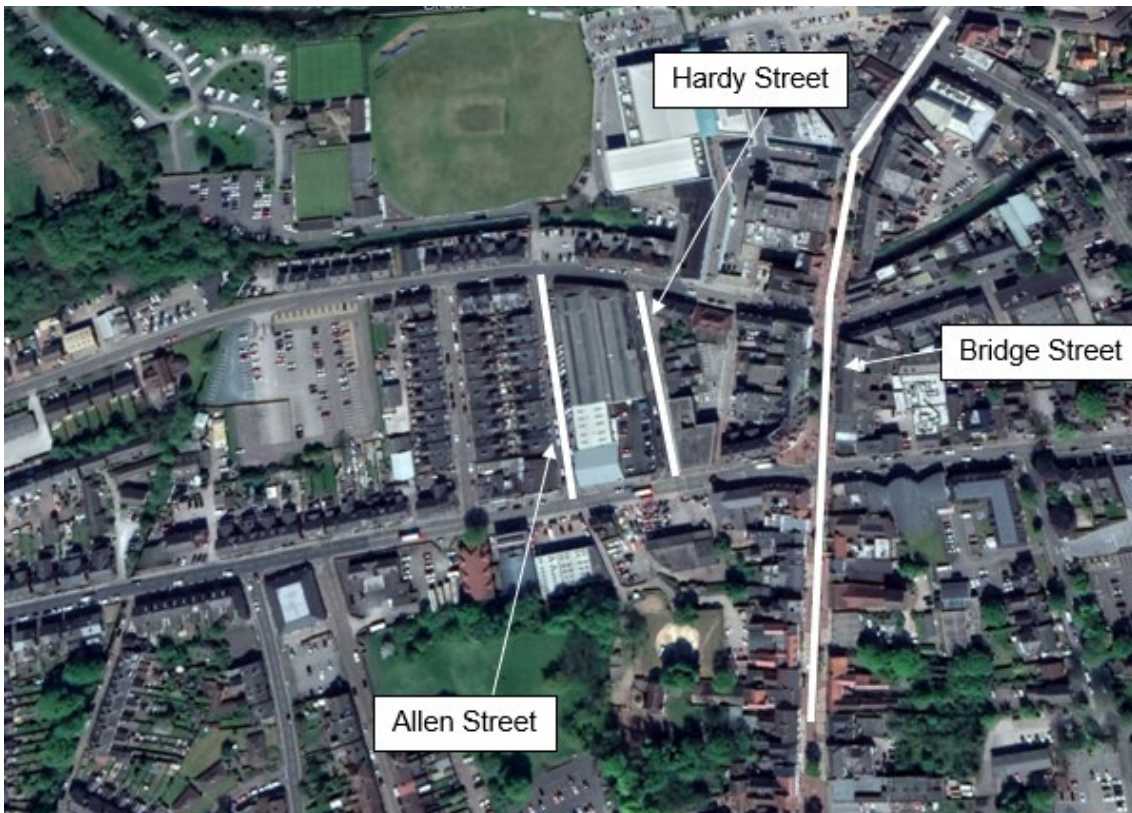
Figure 2. Flood Affected Properties in Workstop