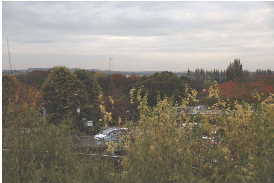
Photograph U - Typical view from west of Nottingham (higher elevations) site is indiscernible.