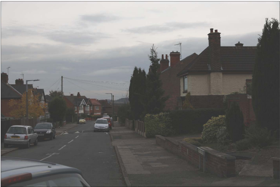
Photograph S - Typical view northwards from Beeston towards the Clifton Slope Ridge - very limited opportunities to view upper elevations of site at distance