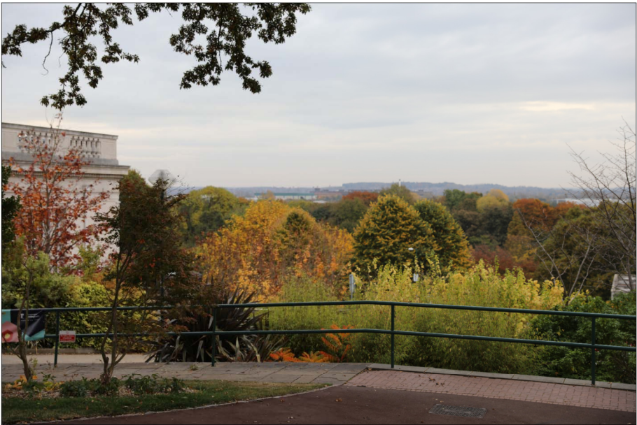
Photograph T - Typical view from upper elevations of the University of Nottingham northwards - site screened from this particular location and the vast majority of the campus.