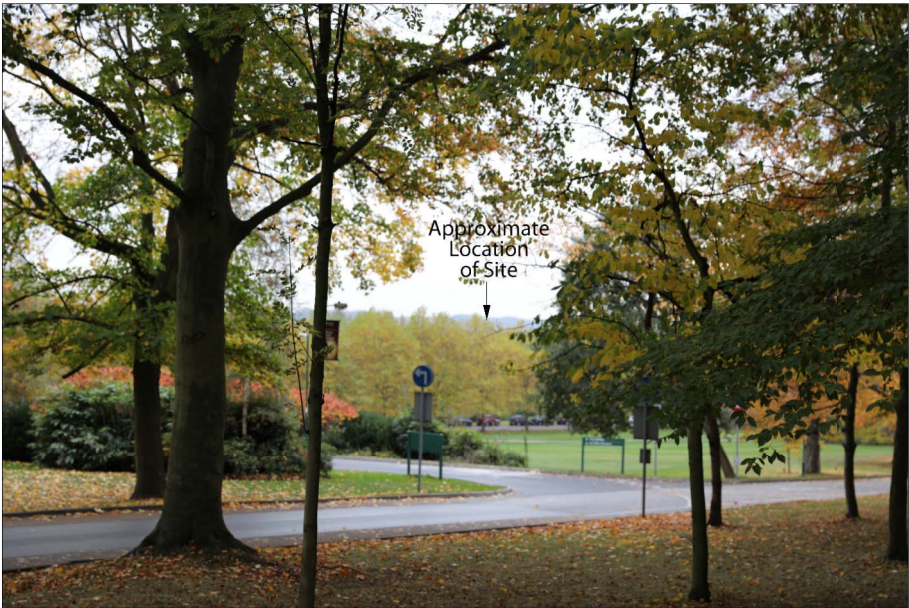
Photograph V - View from within campus of the University of Nottingham looking northwards - Site set within the ridge line.