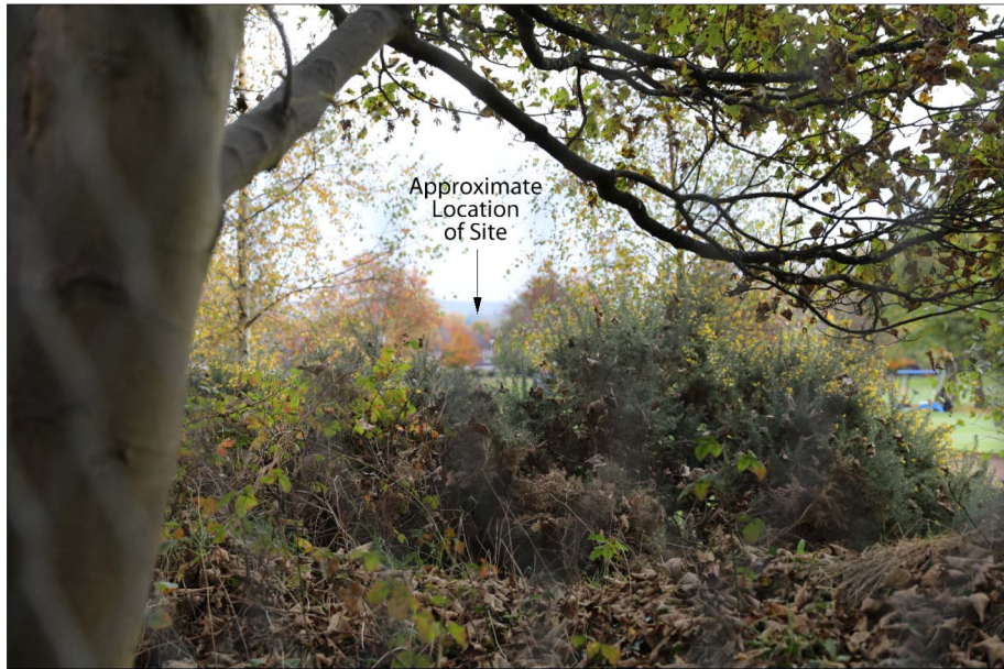
Photograph R - Glimpsed receptor view towards the site from Public Right of Way within Beeston Fields Golf Club