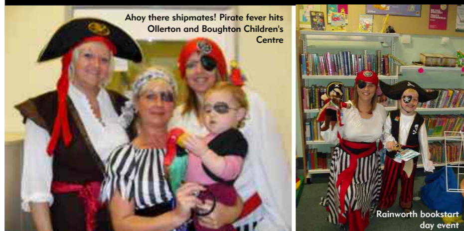
Ahoy there shipmates! Pirate fever hits Ollerton and Boughton Children's Centre