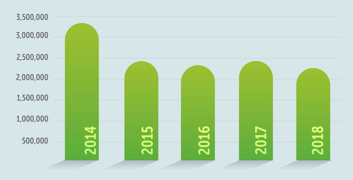
FIGURE 5 WASTE PRODUCTION 2014 TO 2018