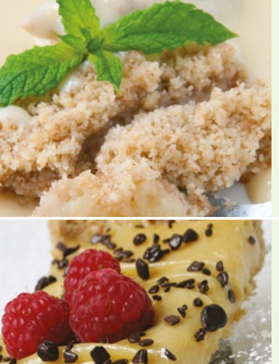
Oaty Apple crumble & custard GLUTEN, MILK Or Yoghurt MILK Or Fruit

Butterscotch tart GLUTEN, MILK or Yoghurt MILK or Fruit