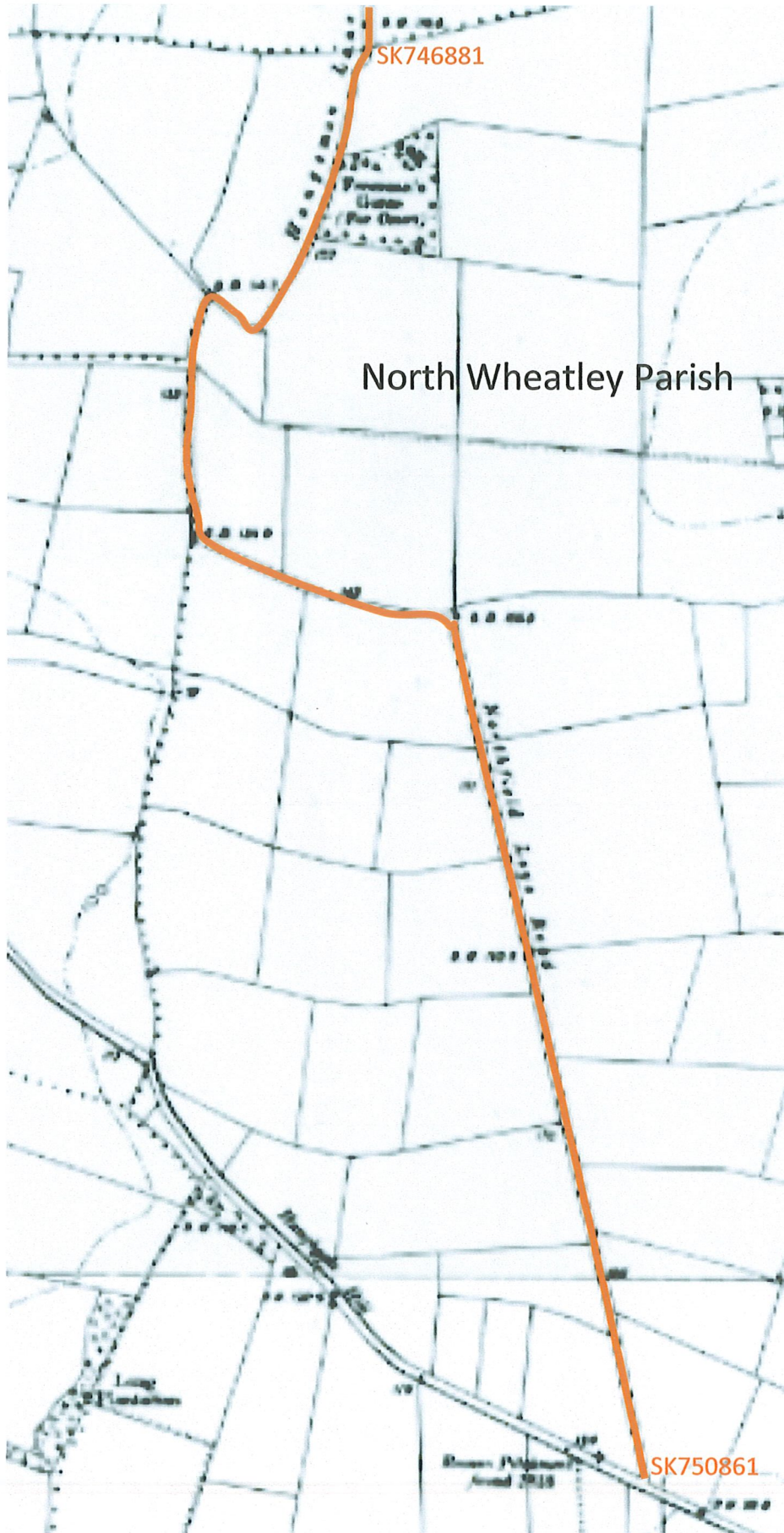
OS 6" published 1901 printed at a scale of 1:14000