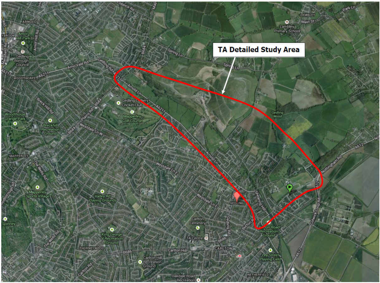
Figure 2: Transport Assessment Study Area