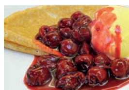
Pancake with frozen yoghurt & hot cherries