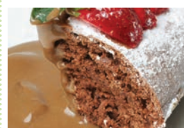
Magic chocolate pudding & chocolate sauce