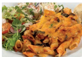
Rigatoni Florentina pasta, garlic slice