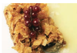
Cornflake tart & custard