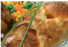
Cheese & tomato parcel & new potatoes