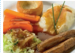
Quorn sausage, Yorkshire pudding, mashed potato & gravy