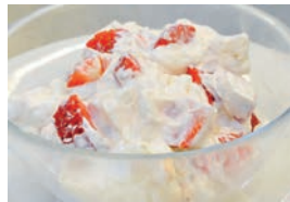
Strawberry Eton mess