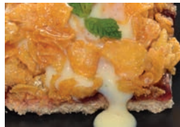
Cornflake tart & custard