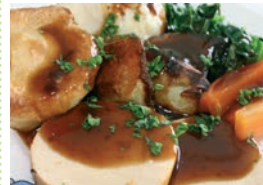
Quorn roast, stuffing, gravy, mashed potato & Yorkshire pudding