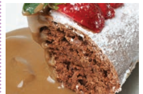
Magic chocolate pudding & chocolate sauce