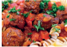
Pork meatballs in tomato sauce & pasta