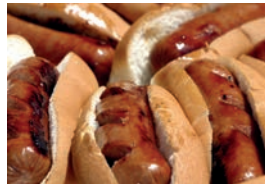
Hot dog & diced potatoes