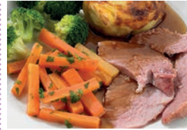
Roast Gammon & pineapple with mashed & roast potatoes