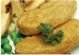
Quorn dippers & baby jacket potatoes