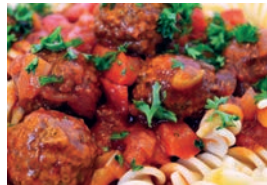
Vegeballs in a tomato sauce & pasta