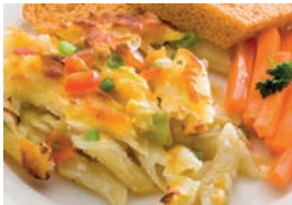
Cheesy pasta bake & garlic bread