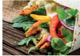
Chicken Tikka wrap & savoury rice