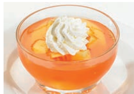
Peaches in jelly & cream swirl