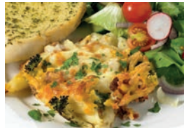
Chicken & broccoli bake, crusty bread