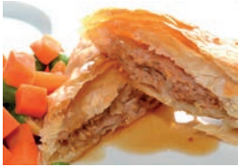
Vegetarian roll, gravy & jacket wedges