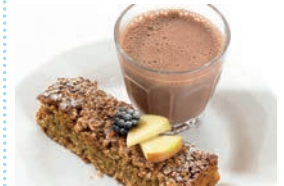
Fruit flapjack & milkshake