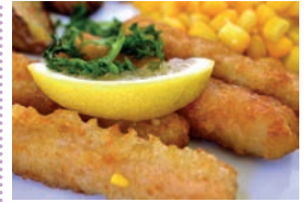
Fish goujons & diced potatoes