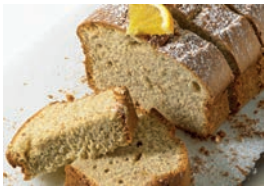
St Clement sponge & custard