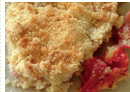
Apple & Raspberry crumble & custard