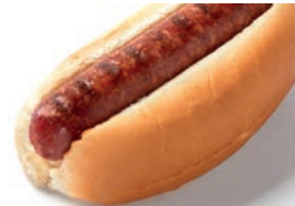
Quorn Hot dog & diced potatoes