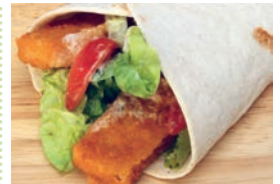
Fish finger wrap & Noisette potatoes