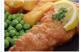
MSC Breaded fish & chips