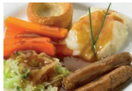
Quorn sausage, Yorkshire pudding, mashed potato & gravy