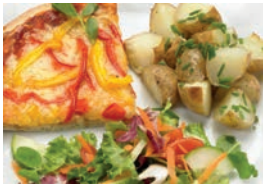
Margherita pizza & new potatoes