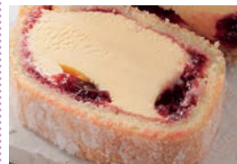
Raspberry ripple ice cream cake