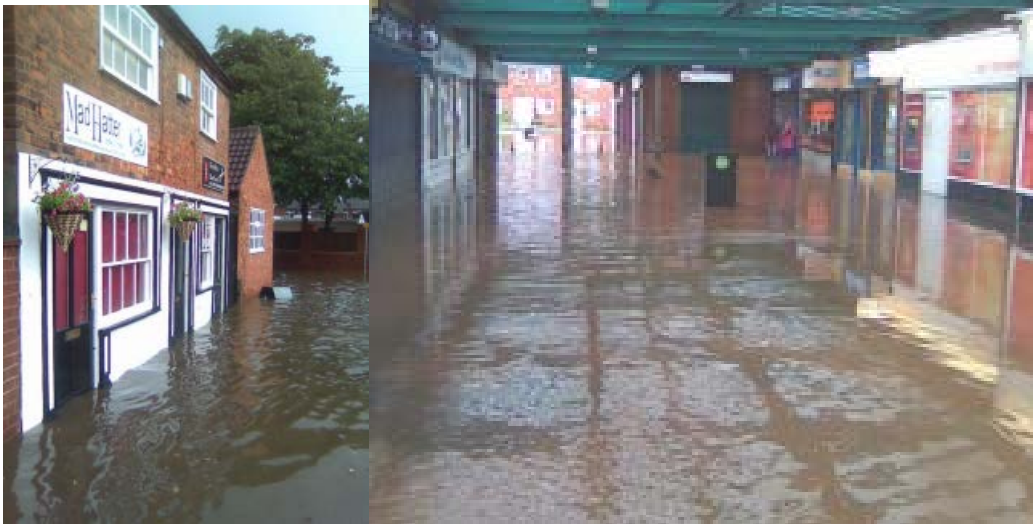
Flooding on Main Street, Calverton