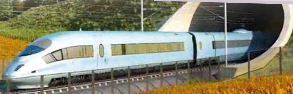
Artist Impression (HS2 Ltd)

95 businesses employ more than 250 people