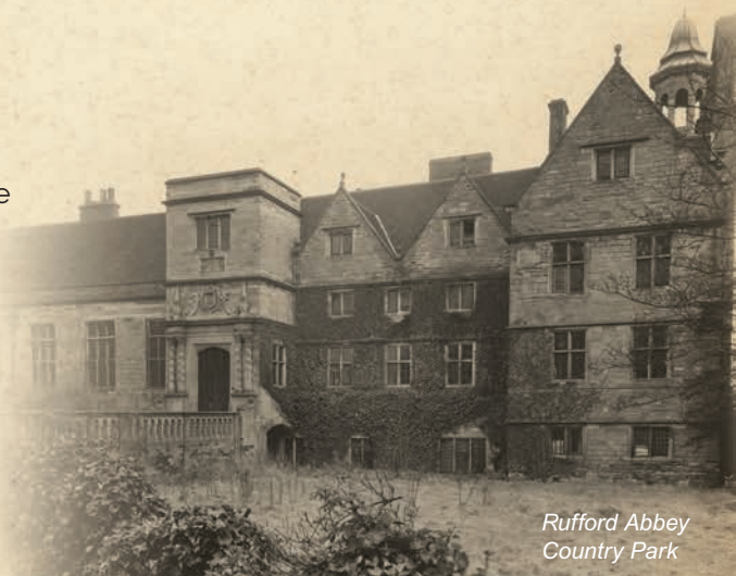
Rufford Abbey Country Park