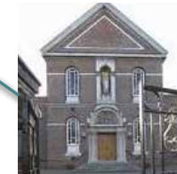
St Philip Neri Catholic Church, Chesterfield Road - site of George Fox's House 7