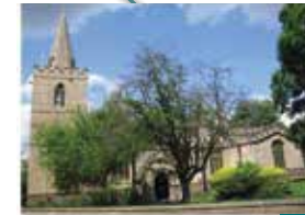
St Peter's & St Paul's Church, Church Side 4

To return to the centre of Mansfield from the New Friends Meeting House , re-trace your steps back along Rosemary Street and turn right at the bottom into Chesterfield Road South. Head past the supermarket and the Catholic Church which should be on your right. Cross St John's Street and continue straight down West Gate until you reach the Market place.