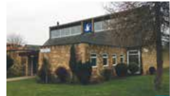
The New Friends Meeting House, Rosemary Street 8