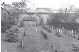
Quaker Way and Quaker Lane 2