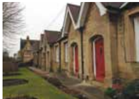
Almshouses, Nottingham Road 3