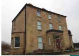
Westfield Folk House, Westfield Lane 6