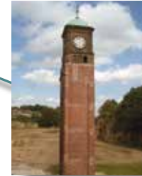
Clock Tower of the Metal Box factory, Rock Valley 5