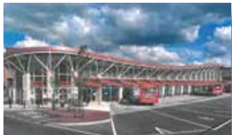
Bus station - site of the Old Meeting House 1