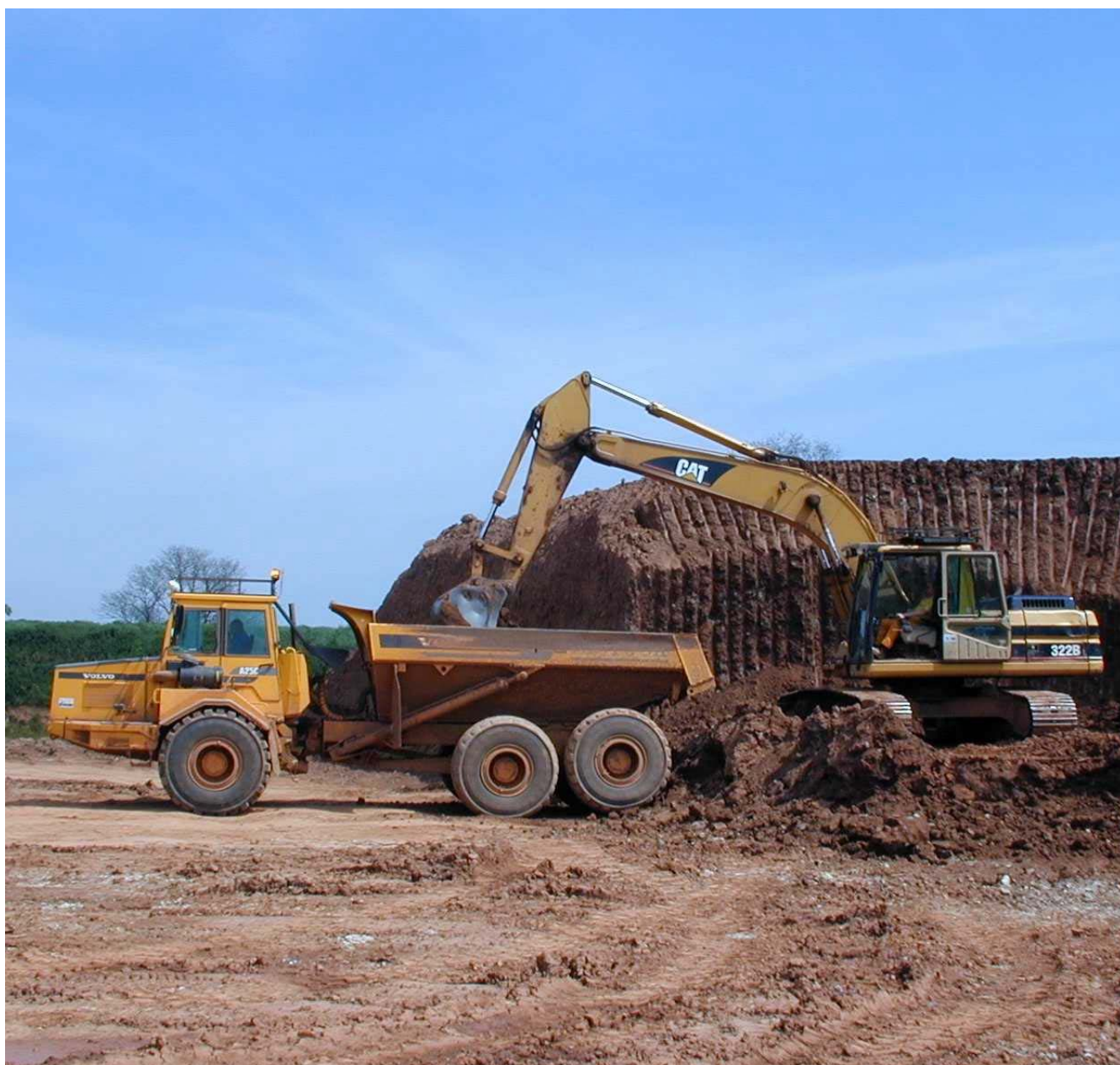
Working Clay Stockpiles at Dorket Head Clay Pit