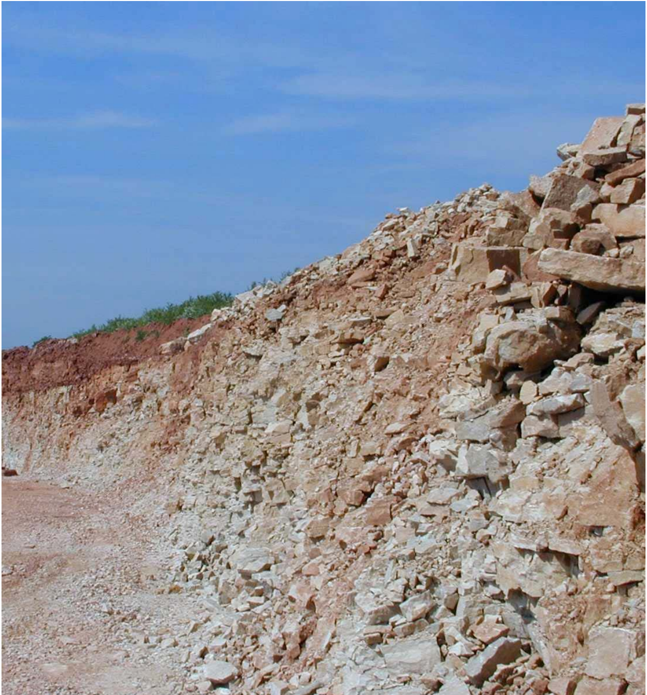
Exposed Limestone Face at Nether Langwith Quarry