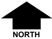
Sign ref A