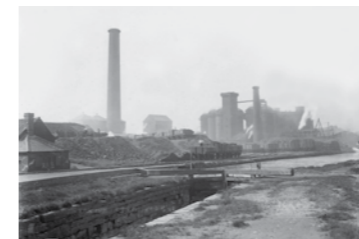
Stanton Iron Works.

The industrial revolution increased the need for transport and this is demonstrated by the existence of two canals in the valley. These canals transported a variety of products but especially coal from the local coal fields which was often taken as far as London. The major ironworks at Stanton also generated a significant demand for transport and along with brick making, pottery, and lace supported the canals until the early 20th Century when railways took over. Again the valley boasted two major lines run by the Great Northern Railway which followed the line of the A610 and the Midland railway which still exists. The need for railway transport resulted in many spin off industries which supported the local economy especially in Long Eaton.