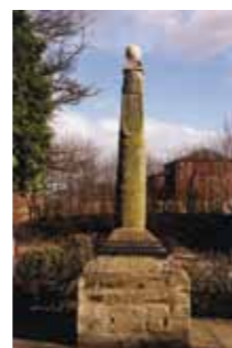
The Saxon Cross in Stapleford.

The valley has long been recognised for its agricultural value particularly its grassland and water meadows. Evidence of ancient ridge and furrow (humps and hollows) meadows can be found throughout the valley but notably at Sandiacre next to the Erewash Canal just down stream of Moorbridge Lane.