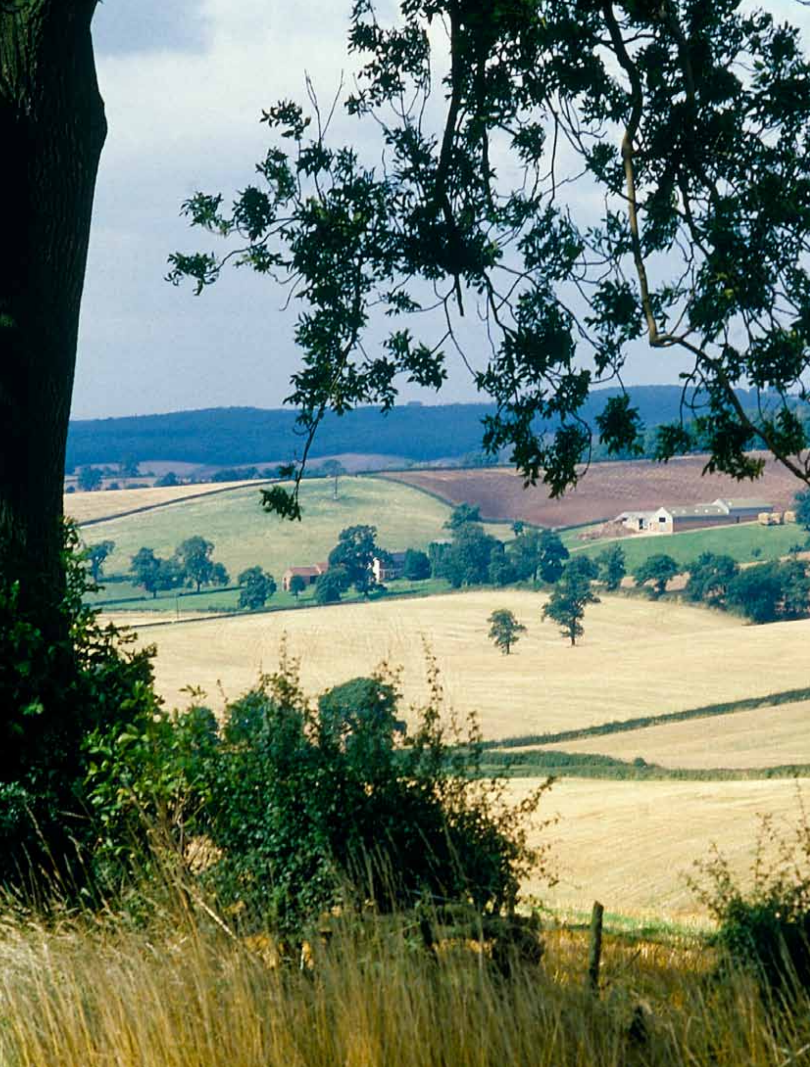
Photos supplied by: Bowbridge School, Newark; Laing O'Rourke; Nottinghamshire County Council. D&P/5.10/Comms/52371