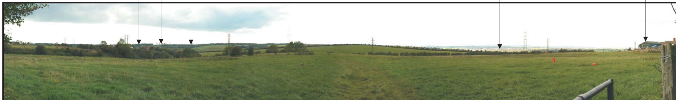
PRINCIPAL VIEWPOINT 4 - PUBLIC RIGHT OF WAY ACCESSED VIA ARTHUR GREEN AVENUE, KIRKBY WOODHOUSE. (GRID REFERENCE E 449068, N 354198, AT AN ELEVATION OF APPROXIMATELY 155m AOD AND APPROXIMATELY 100m FROM THE APPLICATION SITE BOUNDARY).