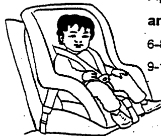
CHILD/ TODDLER SEAT

Approximate age and weight range 6-8 months to 3-4 years 9-18kg (20-40lbs)