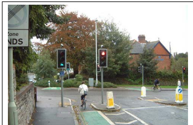
Photo 6.3 Cycle priority at signal controlled junction.