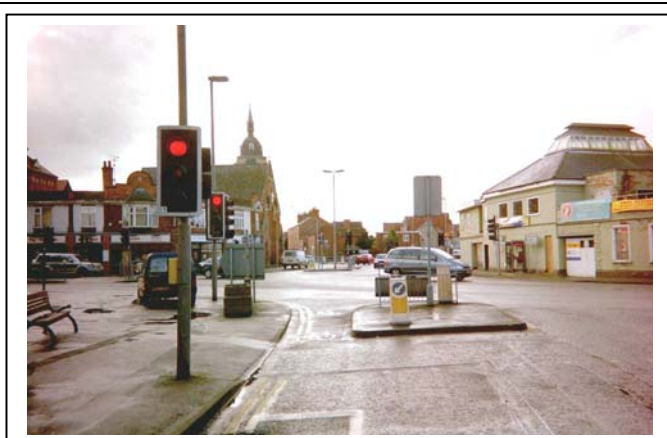
Photo 6.1 Cycle-only signal control at a junction