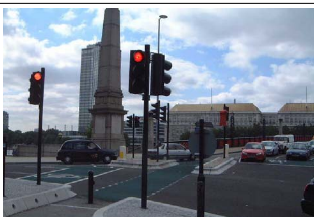
Photo 6.2 Exclusive signal controlled cycle crossing.