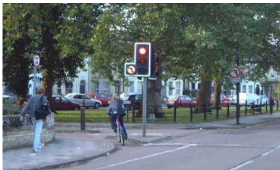
Photo 6.4 Cycle bypass at signal controlled junction.