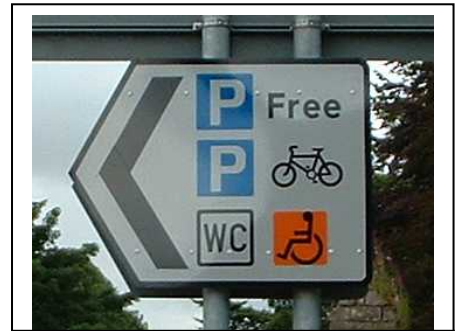
Photo 11.12 Example of direction signing to cycle parking (note this is on a car park sign)