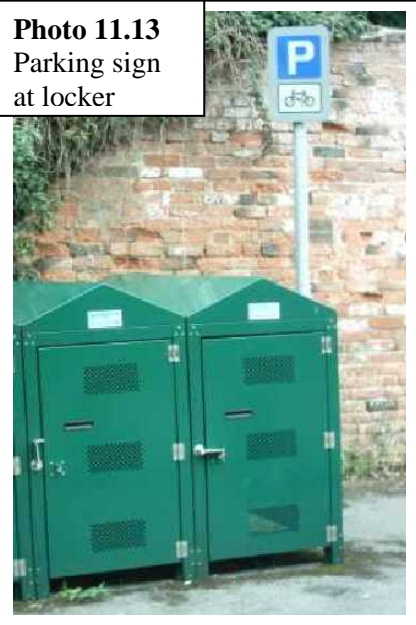
Photo 11.13 Parking sign at locker

The County Council is empowered under Section 63 of the Road Traffic Regulation Act 1984 and under the Highways Act 1980 to provide stands or racks for bicycles in roads or elsewhere. These powers are linked to those enabling the authority to provide parking places.