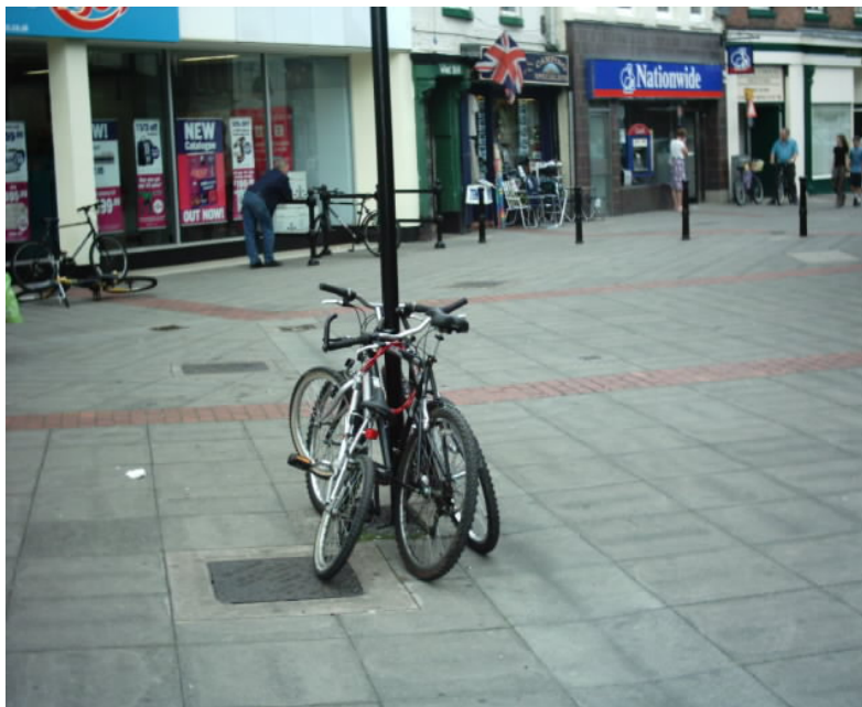
Photo 11.11 Sheffield stands are provided but they are difficult to spot and subsequently are not well used. Signing would help to make them more visible and may prevent cycles being chained to lamp posts/ railings.