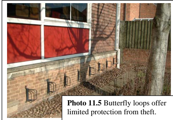
Photo 11.5 Butterfly loops offer limited protection from theft.

DO NOT USE THESE STANDS FOR FUTURE INSTALLATIONS