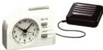
▲ Vibrating/flashing alarm clocks