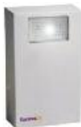
▲ Telephone indicators