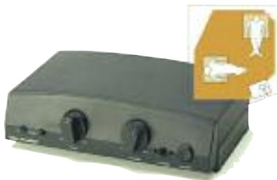
▲ Loop systems

If you are Deaf or deafened you may be able to borrow some of the following equipment from us.