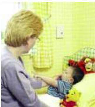
▲ Baby alarms