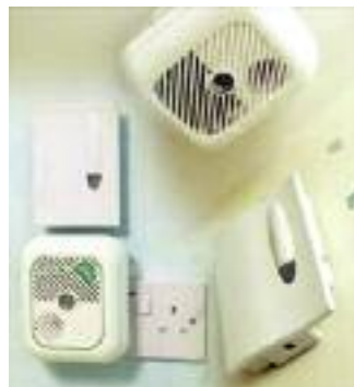
▲ Smoke alarms