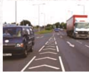
Southwell Road East and Oaktree Lane, Mansfield

From the west the road will run from the A617 at Pleasley Hill, across to Penniment Farm, to join the Sutton bypass at Beck Lane in Ashfield.