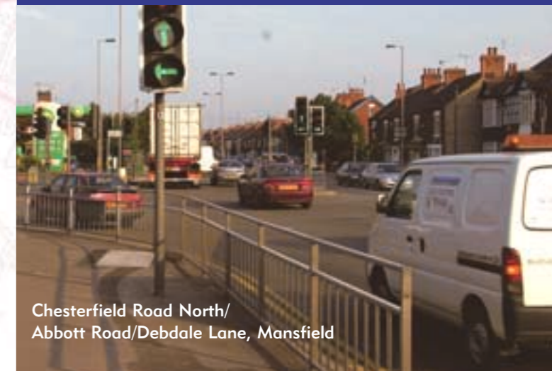
Chesterfield Road North/Abbott Road/Debdale Lane, Mansfield

Some traffic delays will be unavoidable and we would encourage people to allow more time for their journey.