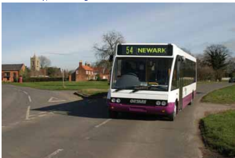
Picture 3.1 Bus service linking rural areas