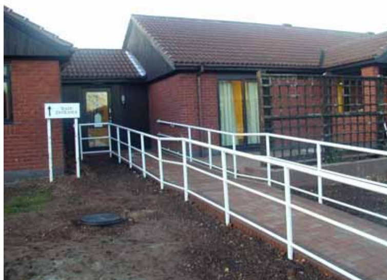
Picture 3.2 Effective improvements to a local facility

The access to health sub-group of Newark & Sherwood LSP has been involved in the development of the accessibility strategy through the identification of the problems people experience in accessing healthcare within Newark & Sherwood District. The LSP has collated the short-term, medium-term and long term priorities of the access to health sub-group.