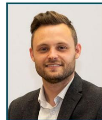
Cllr Ben Bradley MP

You will find on the following pages, details of our plans for 2022/23 and how we will work with our partners to deliver the best for Nottinghamshire and the best value for money. We will also keep talking through the year with you, our residents, about what's important to you and your family and how together we can help make Nottinghamshire the best that it can be for all of us.