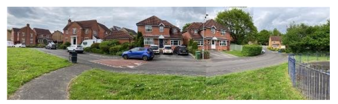
Photo montage of the children's home in use – May 2023. 32 Sudbury Drive pictured centre

4. The property has three hard-surfaced parking spaces one of which emerges partially on to the raised traffic calming platform. The remainder of the front garden is planted.