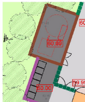
Sprinkler tank and bin store 1:200