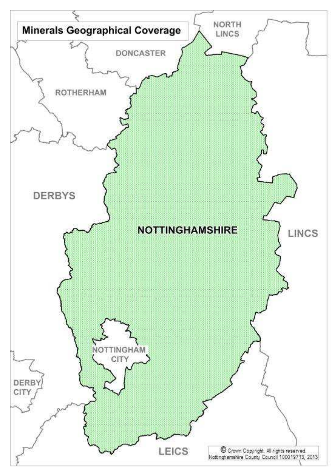
Appendix A – Geographical Plan Coverage