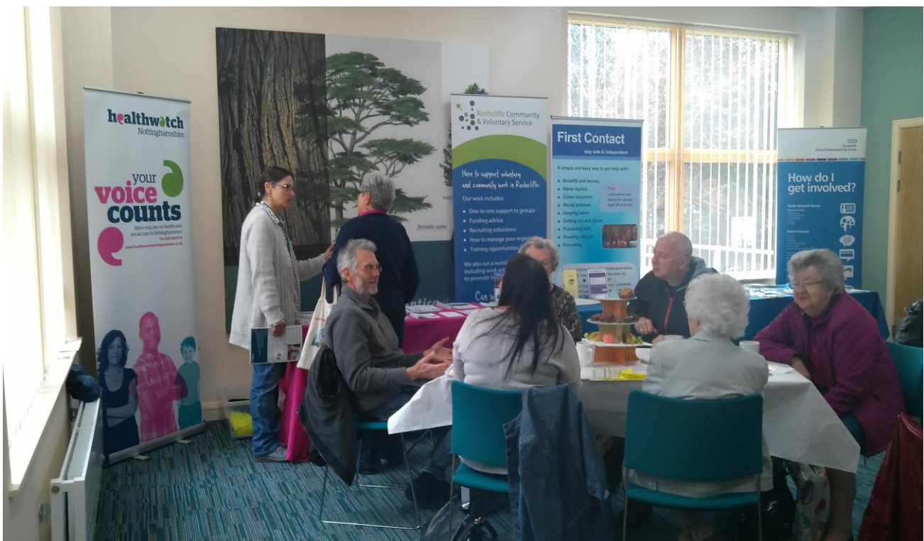
Pictured: Coffee and Chat session