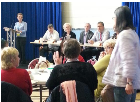
Pictured: Panel receiving questions at Carers' Conference Event

We have developed good working relationships with information and signposting services provided by providers and commissioners so that we can direct people to sources of information and advice about services, as appropriate. However, we do provide information and advice people during the course of our regular engagement activities. An example of this was a member of the public who told us how hard she found the long walk from the front entrance of her local hospital to the ward to visit her husband. When we reported this to the hospital, they told us that visitors could request the help of a porter with a wheelchair to get to the ward. We reported this back to the person concerned, but also made other organisations aware and included the information in local newsletters, so that other people in the same situation know that they can ask for assistance if they need it.