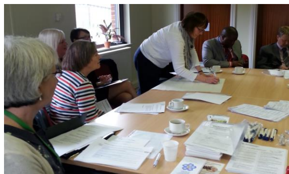
Pictured: Carers' Conference workshop

We contributed to the recent Commissioning for Better Outcomes Peer Review of Adult Social Care, which recommended that the Council should extend involvement of Healthwatch Nottinghamshire in all commissioning areas.