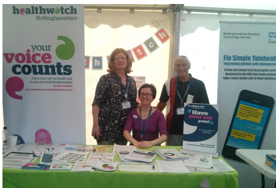
Pictured: Rushcliffe Sunday Funday

We know we still have a long way to go to raise awareness about Healthwatch across all of the communities in the county. In our Annual Survey we asked people if they thought that the majority of local people know about Healthwatch. Only around 20% said that they thought this was the case.