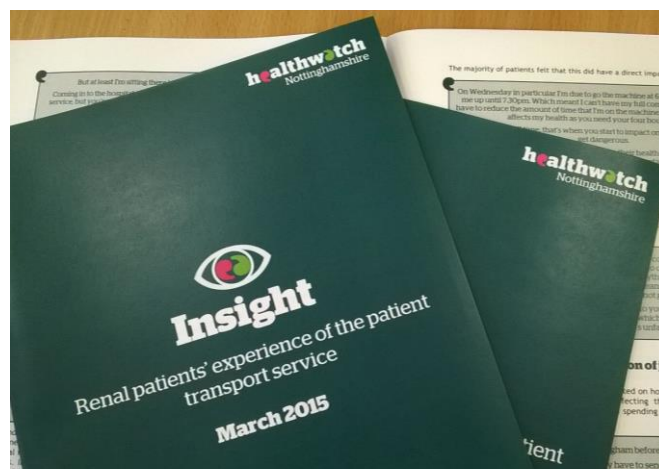
Pictured: Insight report

The report was published in March 2015 and the findings have been presented to the Joint City/County Health Scrutiny Committee, the Nottingham University Hospitals Trust Quality Committee and the Derbyshire and Nottinghamshire Quality Surveillance Group. Arriva Transport Solutions have developed an action plan to respond to the findings of the report and are meeting regularly with the commissioners. We plan to return to the Renal Unit in the autumn to see if the patients have seen any difference in their experience of the transport service