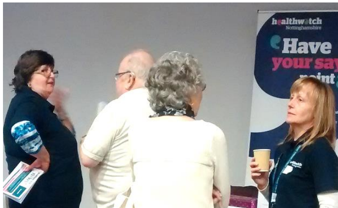
Pictured: Have Your Say at Breathe Easy Celebration Event