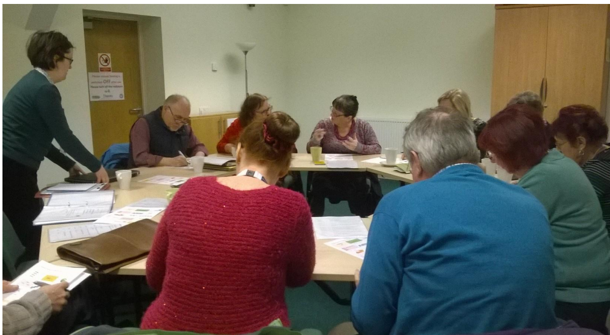
Pictured: Volunteer Training Session

The Enter and View volunteers' first project was the Insight Project into the experiences of patients using the Renal Transport Service to travel to and from the Renal Unit at Nottingham City Hospital. The Prioritisation Panel received a number of comments from patients about the impact of the transport service and felt that an in depth study would be beneficial to better understand patients' experiences and identify possible solutions. (see page 16) The Insight Report has been well received by commissioners and providers and a detailed action plan has been drawn up by the provider to address the recommendations in the report, which is being monitored by the commissioners.