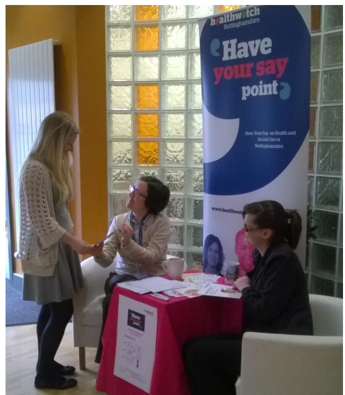
Pictured: Setting up a Have your Say Point

Recently staff of the mobile post office that travels around rural Bassetlaw have also become Healthwatch volunteers taking information out to people in four villages across the north of the district.