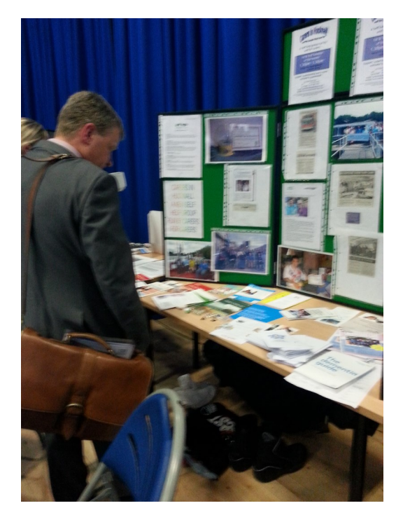
Browsing the information stands at the event