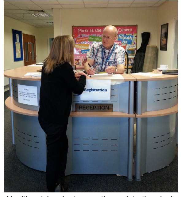
Healthwatch volunteer on the registration desk

Feedback from carers has contributed to all of these actions being taken.