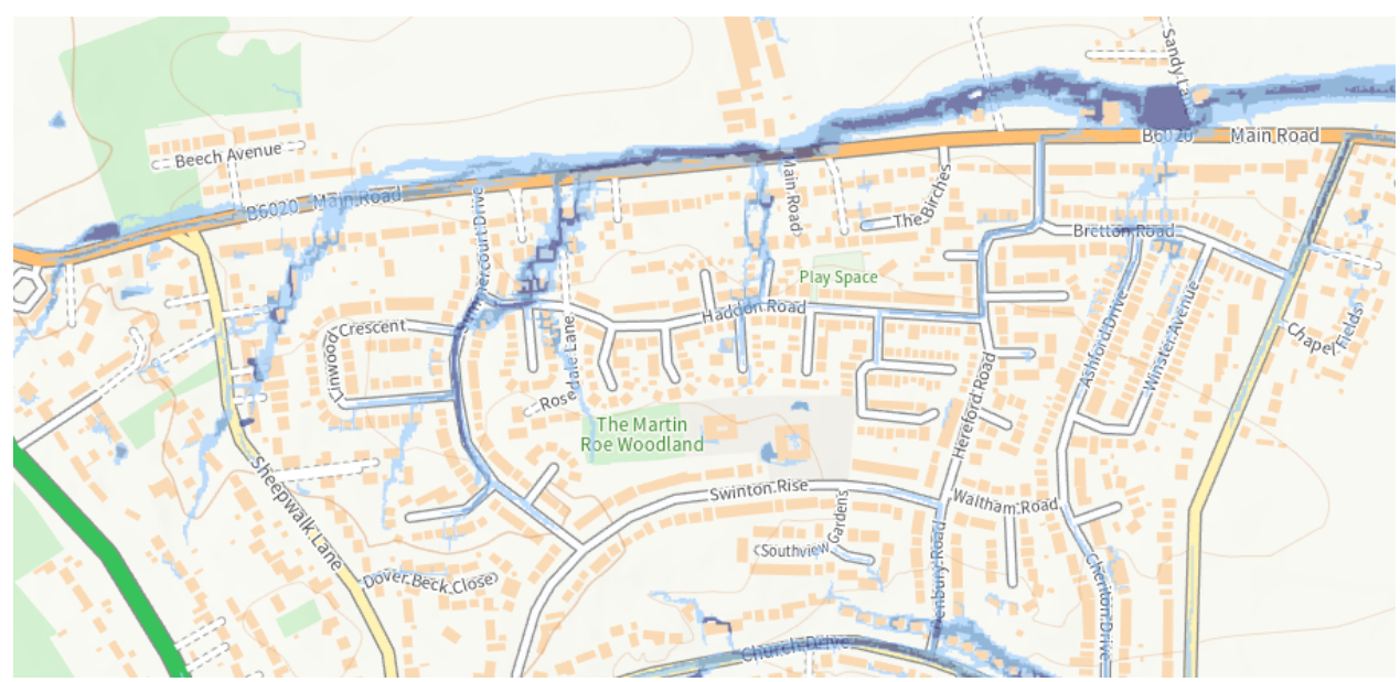
Figure 6. Predicted Surface Water Flood Extents - Rigg Lane

One residential property suffered internal flooding on Haddon Road. As shown in Figure 6, a surface water flowpath flows perpendicular to Haddon Road before flowing downhill along Doveridge Court and reaching Main Road. During the high intensity rainfall experienced, water flowed along this flowpath and into a residential property.