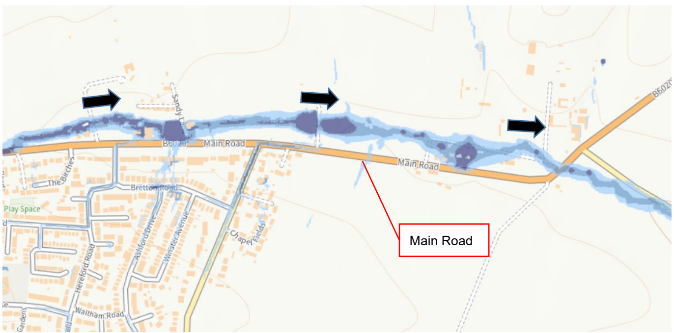
Figure 3. Predicted Surface Water Flood Extents - Main Road

Four residential properties and one business were internally flooded on Main Road with more properties suffering from external flooding. As shown in Figure 3, a surface water flow path is present to the north of Main Road. Water was observed to flow along this flowpath during the flood event. However, water flowing from agricultural land, as well as along the highway was also observed. Several properties along Main Road are built at a lower elevation than the road itself and as a result, in some locations water flowing along the highway flowed through property boundaries.