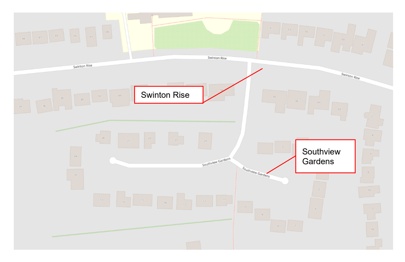
Figure 4. Location Plan - Southview Gardens