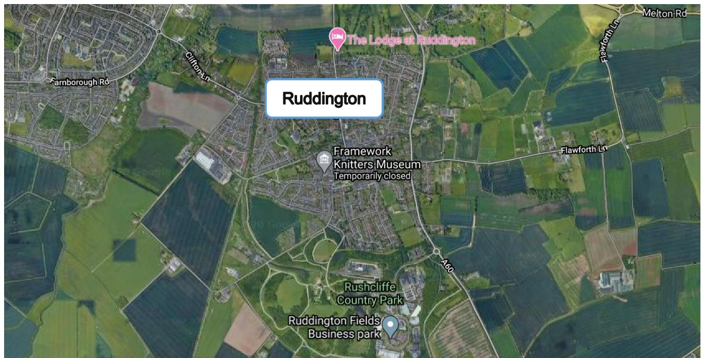
Figure 1. Location Plan

The storms resulted in some areas experiencing over two weeks worth of rain in just two hours resulting in 22 business in the centre of Ruddington suffering internal flooding.