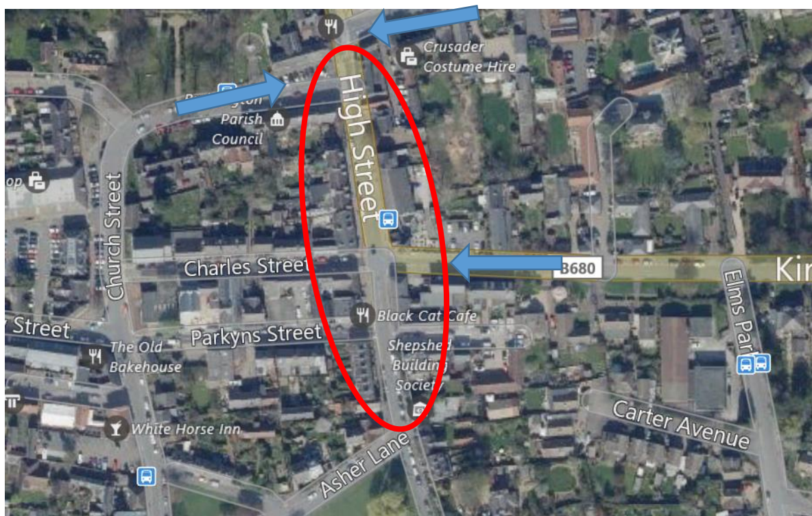
Figure 2. Localised flooding locations

The storms resulted in some areas experiencing over two weeks worth of rain in just two hours resulting in 22 business in the centre of Ruddington suffering internal flooding.