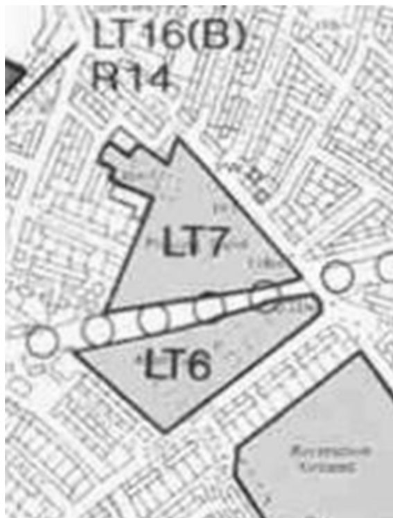
Mansfield District Local Plan 1998