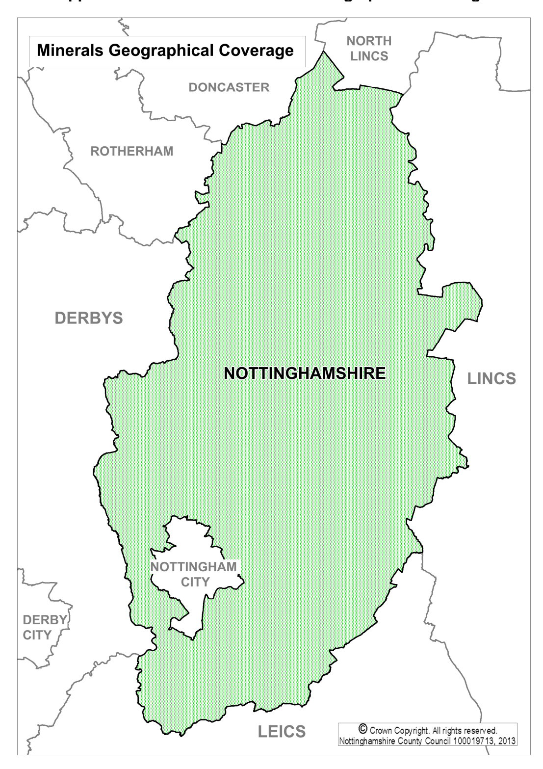
Appendix A – Minerals Local Plan Geographical Coverage