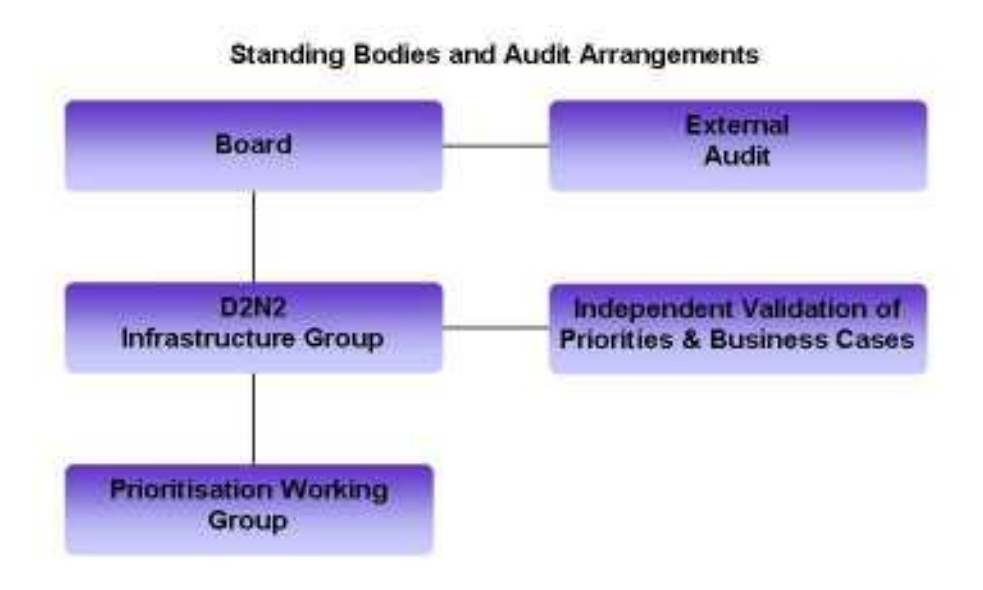
PART 1: GOVERNANCE